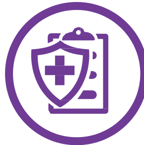
Emergency Relief & Response