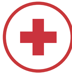
Health & Medical Services