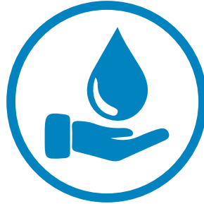
Water Sanitation & Hygiene