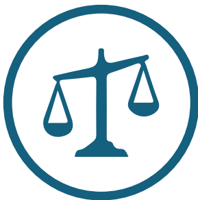
Advocacy & Social Justice