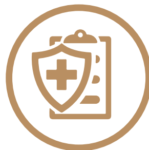
Emergency Relief & Response